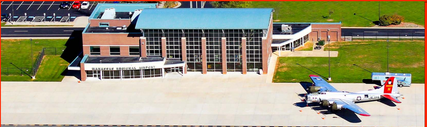
Manassas Regional Airport