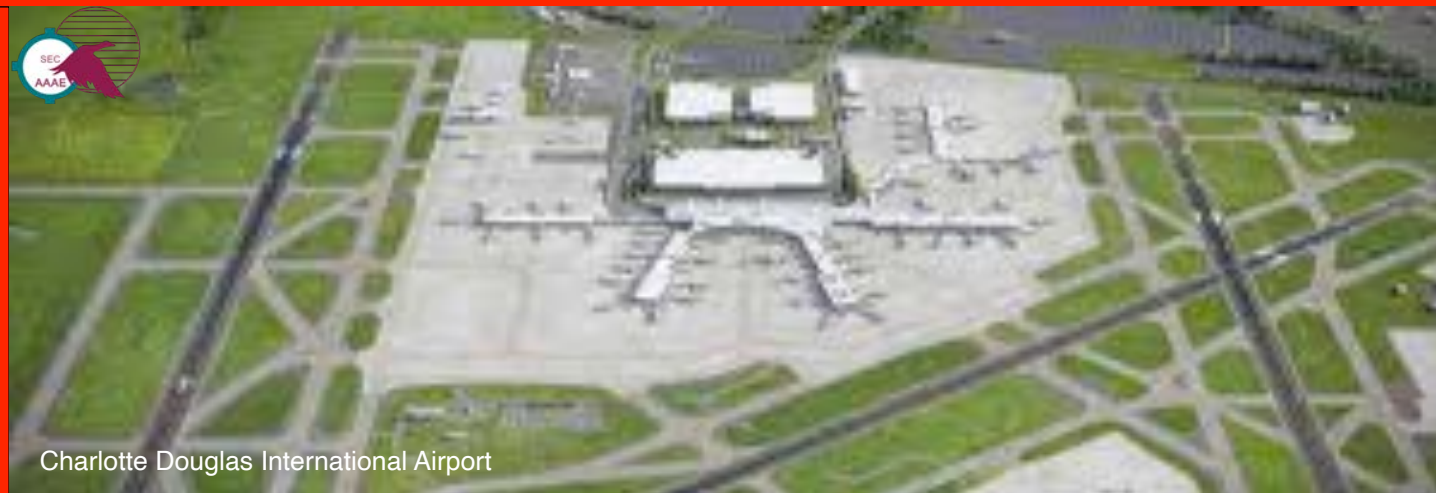
Charlotte Douglas International Airport